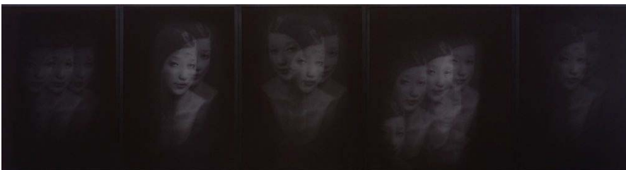
Taguchi Kazuna Look How Long I've Grown Waiting for You , 2007