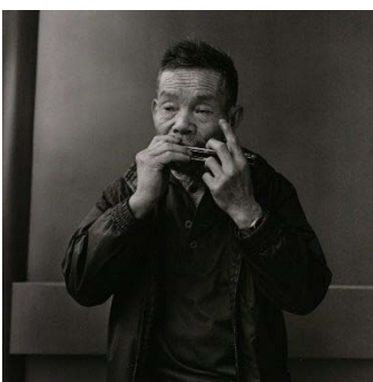
Kikai Hiroo Man Playing the Mouth Organ From the series Ecce Homo , 1986

A photograph is something that extracts a given time and imprints it on an image, but artists make use of a variety of techniques to create works that imbue these temporal elements with greater depth. How do artists handle and express the invisible concept of time in their work? In this section, we begin with August Sander. Sander's portraits not only depict the appearance of his subjects at the time they were taken, but they also express the time in which these people lived. Yoneda Tomoko's compositions, showing texts and other works by famous 20th-century intellectuals as seen through their own eyeglasses, inspire us to imagine the times in which these figures lived and the emotions and conflicts they experienced in these periods. There is a diverse range of other time-related images, including a work by Sugimoto Hiroshi, which captures the appearance of a movie screen from the beginning to the end of a film.