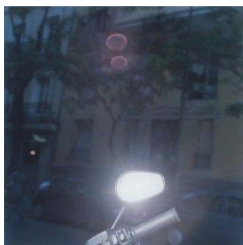
Kawauchi Rinko From the series Illuminance, 2009 Chromogenic Print