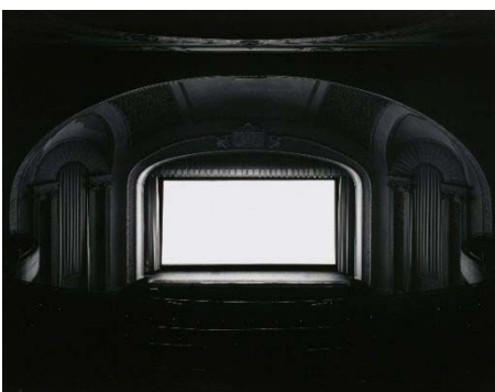
Sugimoto Hiroshi U. A. Playhouse, New York From the series Theaters , 1978