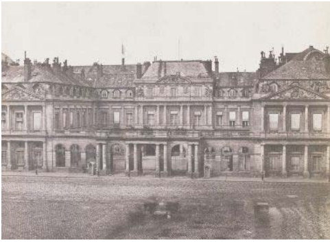
Édouard-Denis Baldus Palais Royale , c. 1850-59