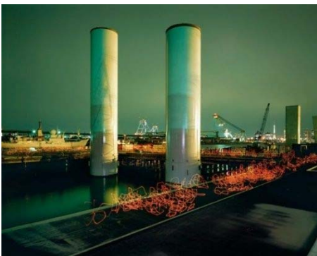
Sato Tokihiro 《CC #35》 From the series Breath-graph , 1992