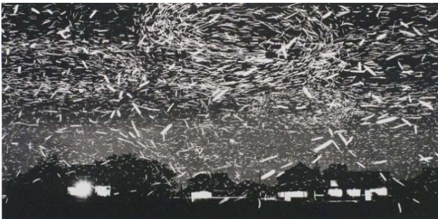
Midorikawa Yoichi Fireflies From the series Seto Inland Sea and Its Neighborhood , 1957