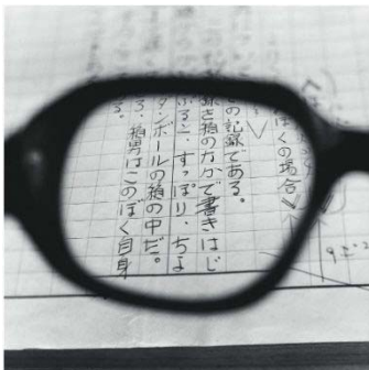
Yoneda Tomoko Abe Kobo's Glasses-Viewing the Manuscript of "The Box Man" From the series Between Visible and Invisible , 2013